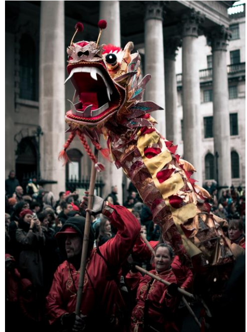
Dragon Dance 舞龙

According to Chinese legend, dragons are very powerful creatures, with supposed control over the weather and rain especially. They live at the bottom of seas, rivers and lakes and can fly among clouds.